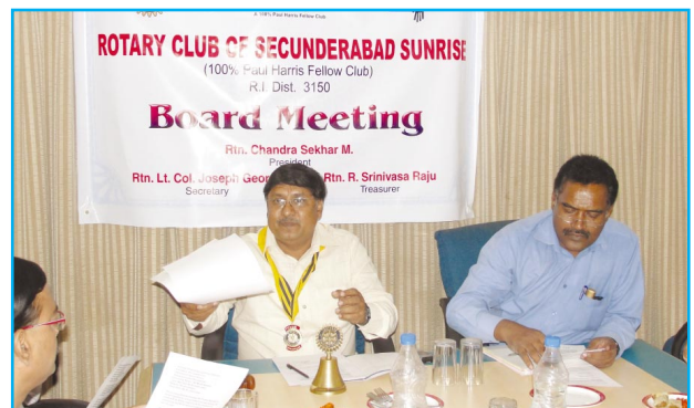
President and Secretary at Board Meeting