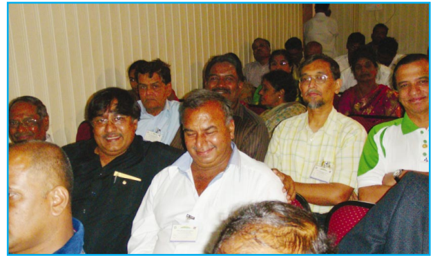
President and other Club members at District Membership Seminar held at Hanamakonda