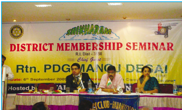
District Membership Seminar held at Hanamakonda