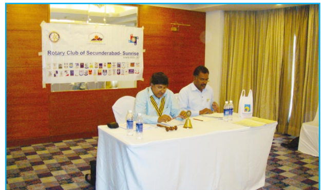
President and Secretary at Club Assembly